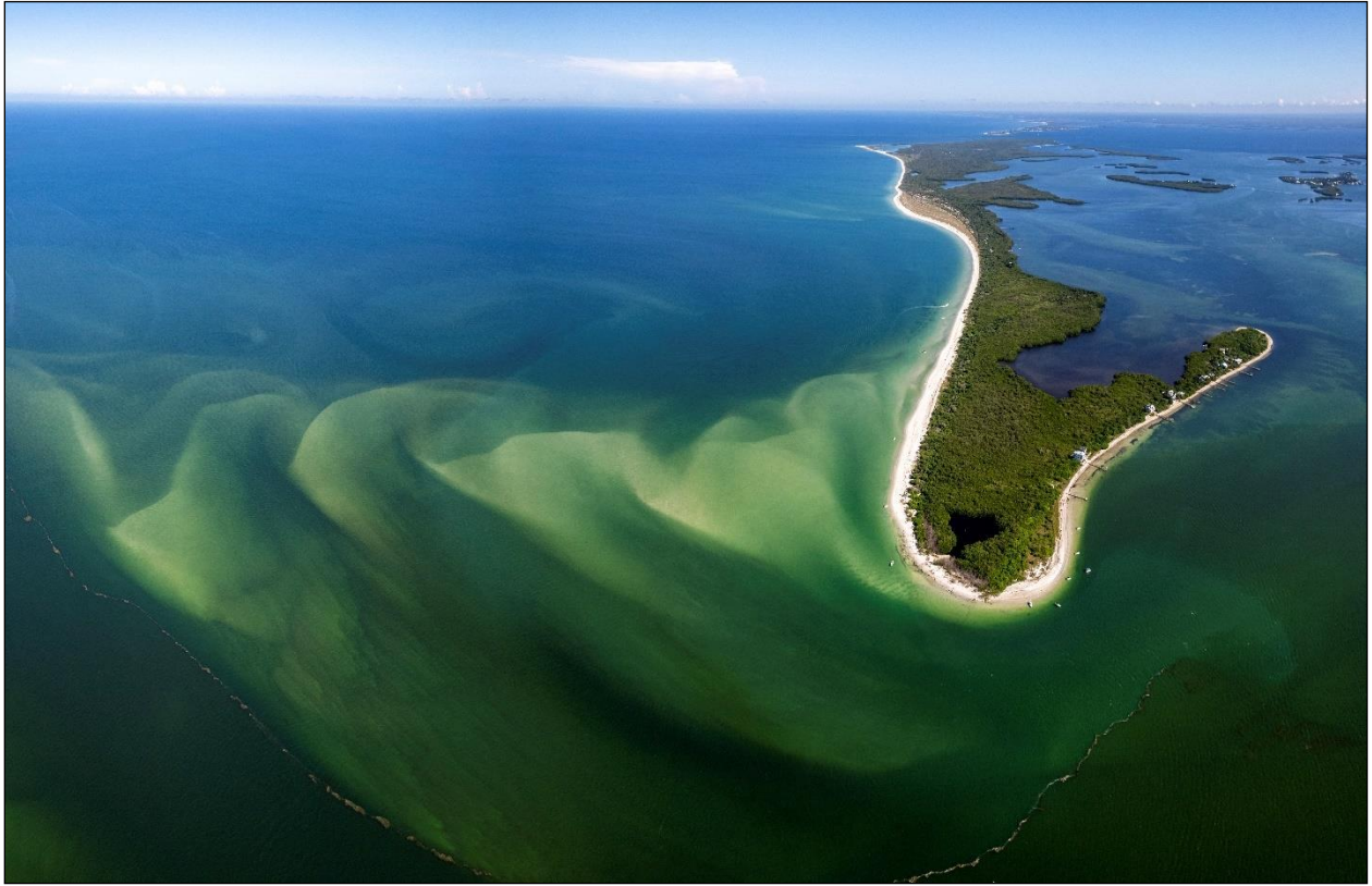
Aerial view of the barrier island of Cayo Costa prior to Hurricane Ian's landfall.