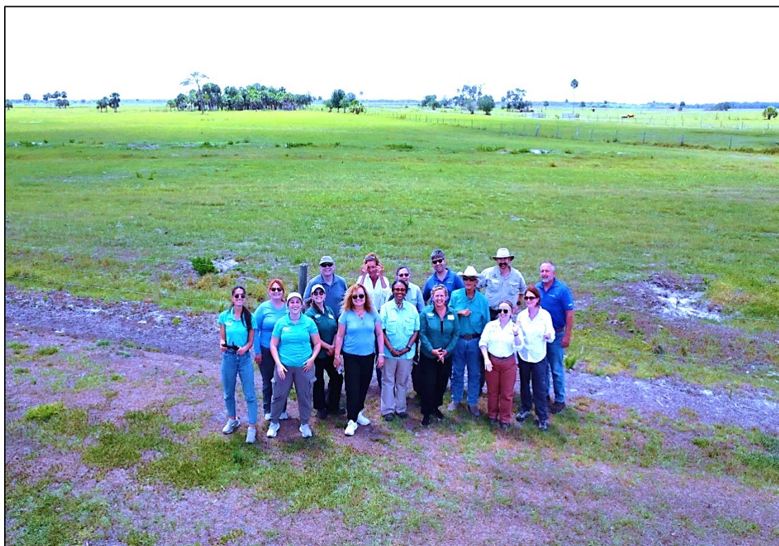
CHNEP staff, EPA staff, and other partners at Blackbeard's Ranch during the 2025 Program Evaluation site visits.