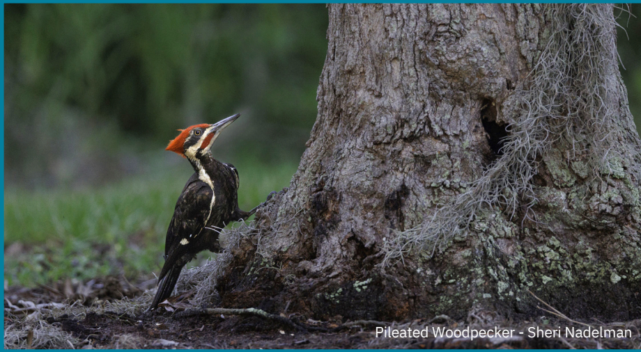
Pileated Woodpecker