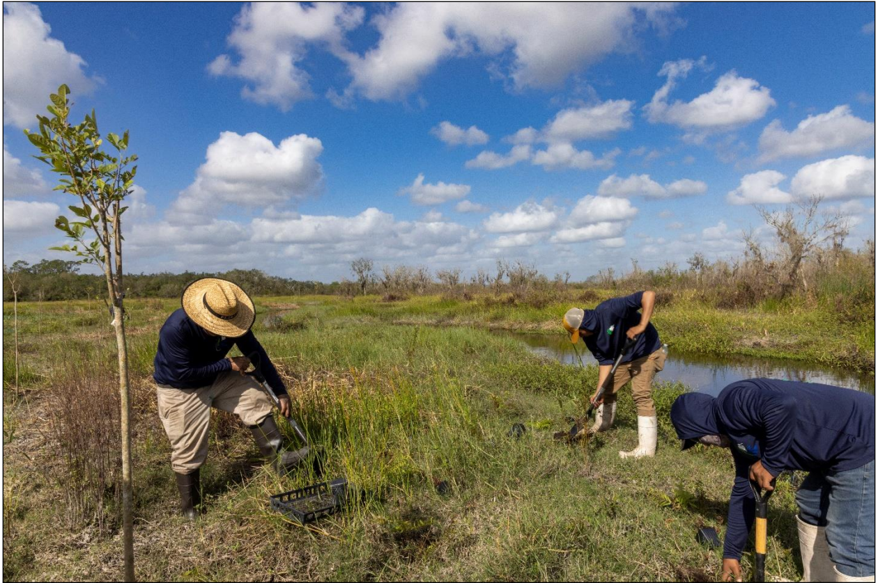
CHNEP contractor undertaking native plant restoration at the Myakka Headwaters Preserve.