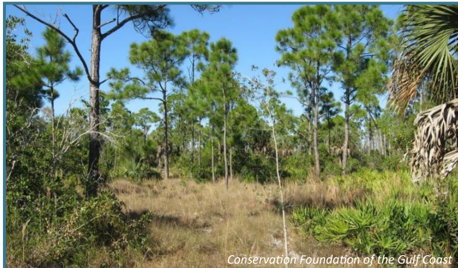
Conservation Foundation of the Gulf Coast