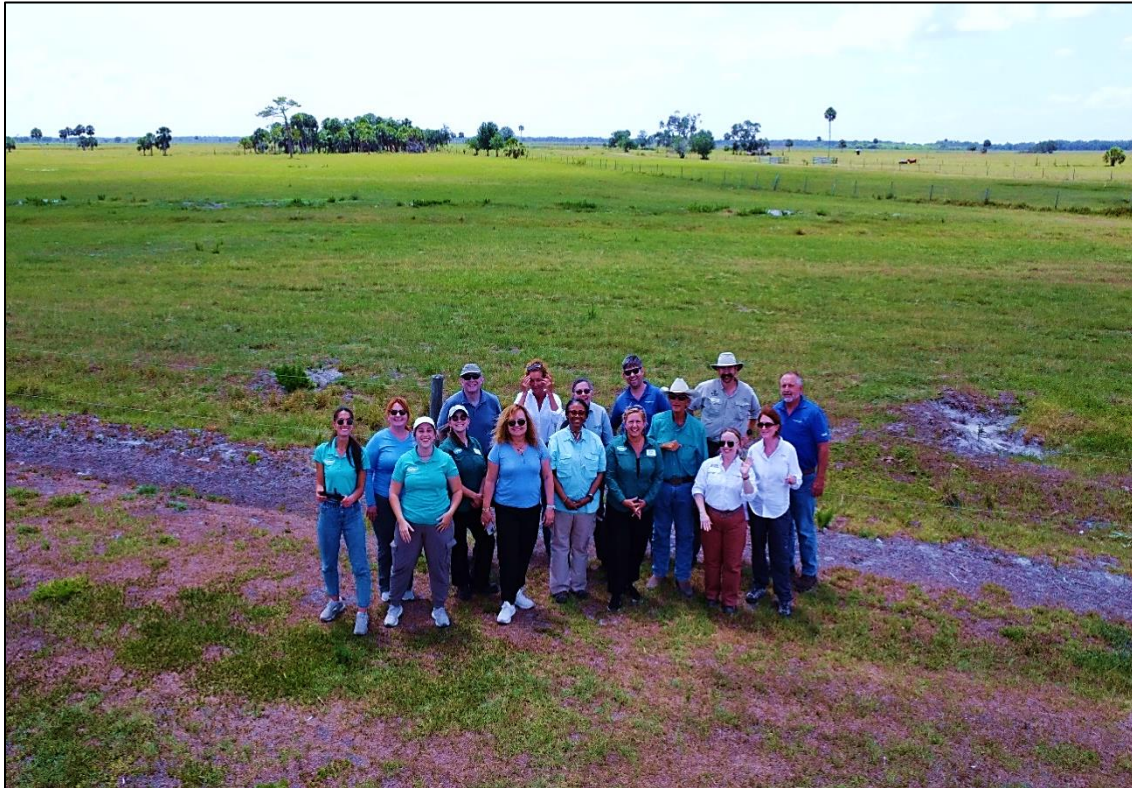
CHNEP staff, EPA staff, and other partners at Blackbeard's Ranch during the 2025 Program Evaluation site visits.