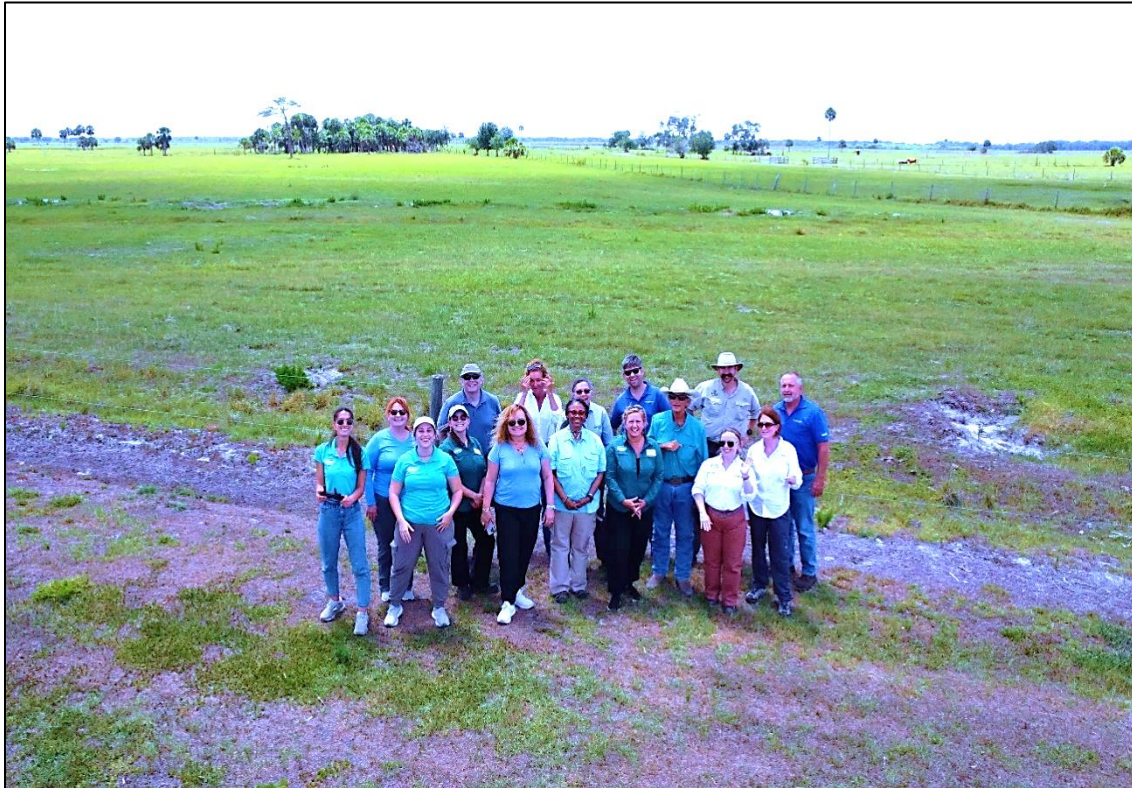
CHNEP staff, EPA staff, and other partners at Blackbeard's Ranch during the 2025 Program Evaluation site visits.

May 22, 2025 Amended September 25, 2025 Amended January 22, 2026