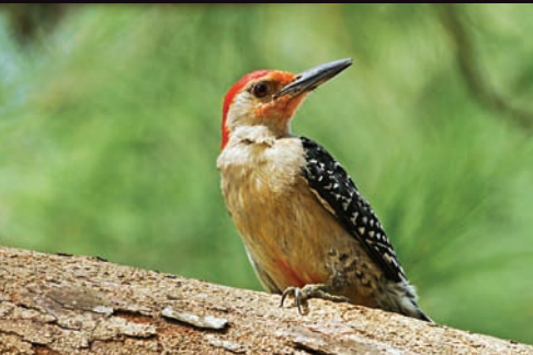
RED-BELLIED WOODPECKER

What do you think of this calendar? Take a survey posted on the website at www.CHNEP.org .