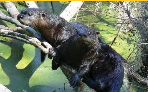
RIVER OTTERS READY TO PLAY, CIRCLE B-BAR RIVER RESERVE

CHARLOTTE HARBOR WATERSHED SUMMIT March 25–27, 2008 Edison College, Punta Gorda The Summit is an important step in the CHNEP process of bringing public and private stakeholders together to discuss ongoing studies and critical environmental issues facing the region. It is an opportunity to review progress and discuss current and emerging issues affecting the Charlotte Harbor watershed. For more information, go to www.CHNEP.org . What do you think of this calendar? Take a survey posted on www.CHNEP.org