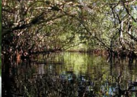
TIDAL CREEKS ON BUFFER PRESERVE