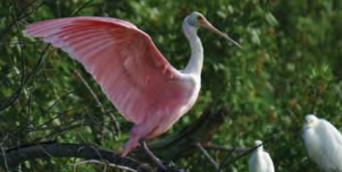
S-T-R-E-T-C-H ROSEATE SPOONBILL, BOCA GRANDE |Misty Nabers Nichols