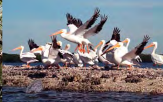
WHITE PELICANS AT TARPON BAY, SANIBEL |CA Rothman